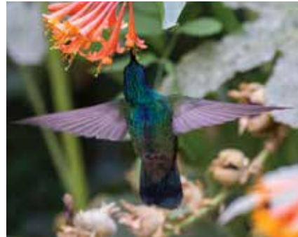
Mexican Violetear Montana's first record, Fort Smith, Montana 9-6-2024.

In any given year the MBRC will review between 20-50 rare bird reports. Currently, of the 448 bird species on the Montana list, 106 species are review species. 17 new bird species have been added to the official list in the last ten years, and the newest addition in 2025 was a Mexican Violetear .