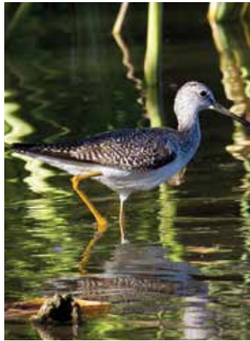
2025 point counts added two new shorebird species to the Indreland Audubon Wetland Preserve. Spotted Sandpiper (l) and Greater Yellowlegs (r).

(number of bird species and abundance of each species) related to proposed wetland restoration activities and the potential designation as a wetland mitigation bank.