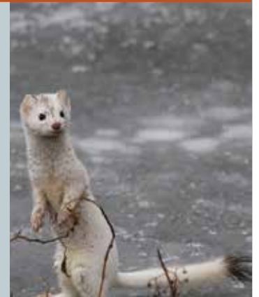
Ermine at the Indreland Preserve on World Wetland Day.

Wetlands are largely formed by forces of nature over time. Historically however, many wetlands have been further shaped by generations of knowledge and practice to become cultural heritage landscapes.