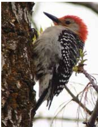
Red-bellied Woodpecker Belgrade, Montana 5-21-2024.

In the 1960's with the advent of better field guides, optics, and identification skills, requiring a specimen for posterity no longer seemed necessary. Around this time, Bird Record Committees (BRCs) began to take shape in Europe. In the United States the first BRC came into existence in 1970 when California's BRC was formed. Montana followed suit in 1991. During these formative years, BRCs mainly relied on written reports, oftentimes with field notes and drawings to accompany the official rare bird forms.