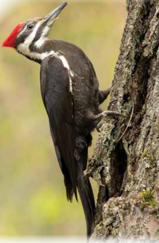
Pileated Woodpecker