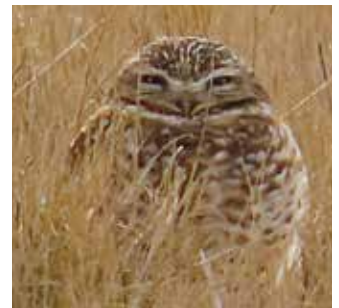
Burrowing Owl Montana's first over wintering record.

surprises in our corner of southwest Montana. You may remember that a Burrowing Owl was discovered along Bench Road south of Three Forks on December 1st. This Burrowing Owl was relocated on January 13th by Robin Wolcott , and was continuing to be seen into February. This is the first documented over wintering Burrowing Owl for Montana , and the first February record.