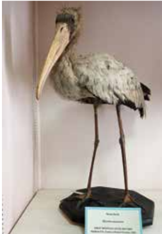
Wood Stork, Montana's first and only record, collected near Ennis October 1902. Specimen in the Montana State University collection.

H ave you ever wondered how many species of birds have been seen in Montana, and who decides if a bird species is added to the cumulative state list? The answer to the first question is 448 bird species as of February 2026. You may not be familiar with the Montana Bird Records Committee (MBRC) , but this is the volunteer body that evaluates all rare bird reports and keeps an official list documenting the naturally occurring birds in the state, and a list of any bird species to be reviewed.